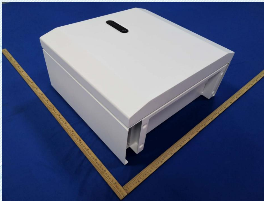
Figure 1 Front view of battery