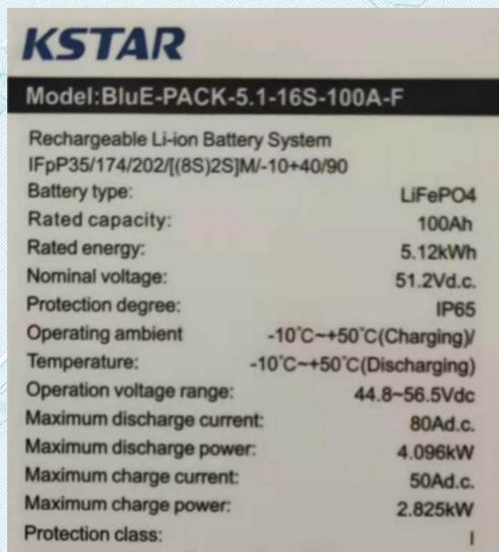
Figure 5 Label view