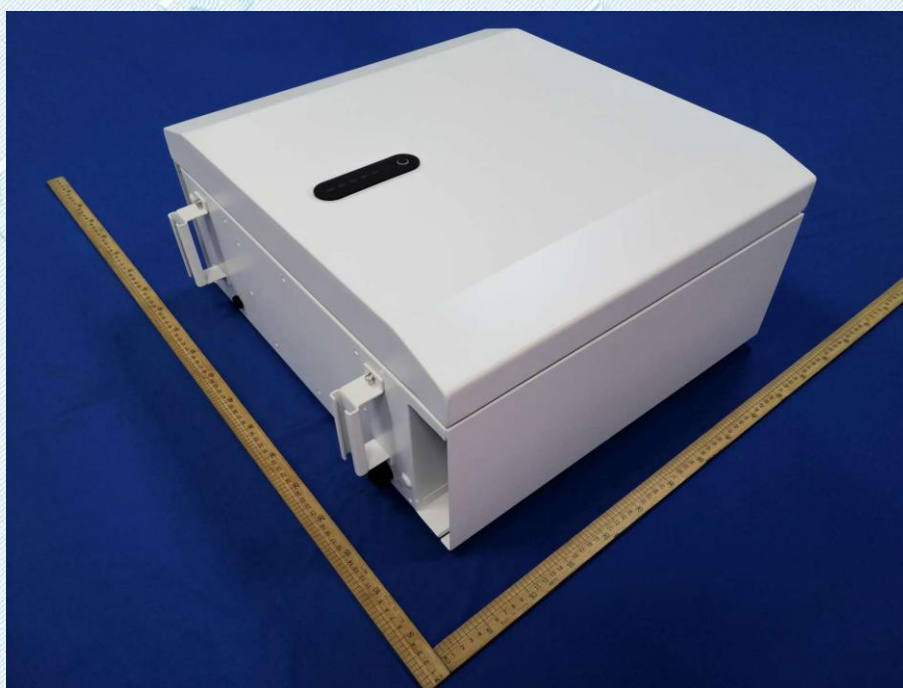
Figure 2 Back view of battery